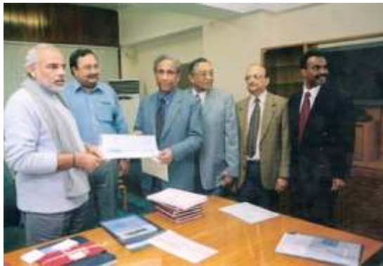
Donating Rs. 2 crore to the CM relief fund for Tsunami relief

There are such limitless instances when GSPC Group strikes compassionate chords with the society. And GSPC relishes every act of compassion that leads towards the societal well-being, bettering the life of individuals. The cultural programs, festivals, social awareness campaigns and volunteer activities are just the right opportunities for GSPC to act and reinforce its commitment towards the society. The GSPC Group prides itself in being always there for the society and desires to be closely intertwined with the society in future as well.