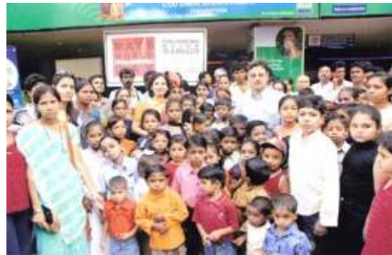
Photograph of Thalesemia patient after his recovery