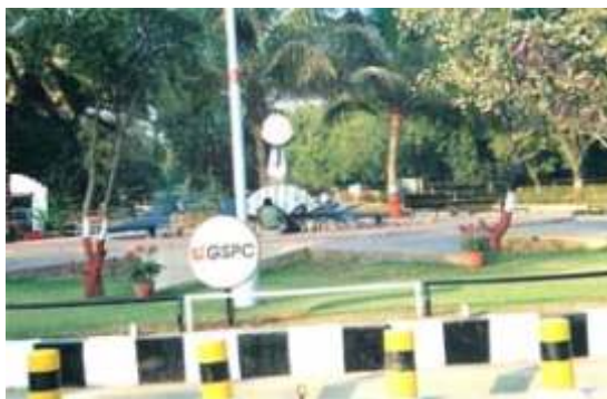
Traffic Island at J5 Circle, Gandhinagar Circuit House